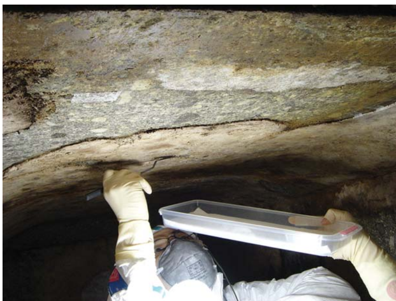
Detaching a wall painting from the ceiling of the Kitora Tumulus

The paintings of the four guardian gods of