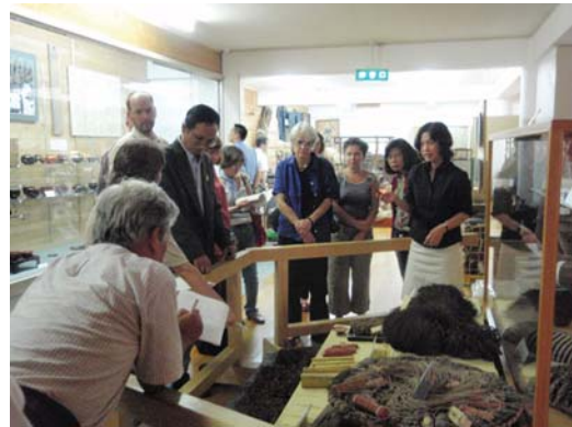
Studying folk materials associated with urushi and collecting of urushi sap, The Museum of History and Folklore in Joboji (Ninohe-shi, Iwate prefecture)

properties made of urushi in various nations. This and the exchange of diverse information concerning urushi were extremely meaningful not only for the participants but also for us in conducting future courses.