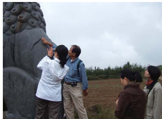
Field study at the East Gate of Qianling Tomb

environmental monitoring after restoration. The results of the training are expected to be put to use in the execution of restoration in the final year of the projects.