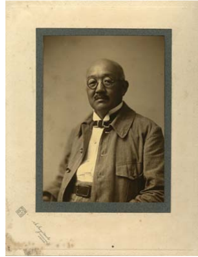
Portrait of Kuroda Seiki, date unknown. 20.5 x 15.3cm