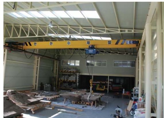
Conservation site of the Three-storied Pagoda of Gameunsa site

On November 23, we participated in the International Symposium on Conservation of Stone Cultural Properties held at the Kongju National University and spoke on the investigation that the National Research Institute for Cultural Properties, Tokyo is conducting at Usuki Stone Buddha, a national treasure and an important historic site. We received questions and much advice from many researchers that will be of use in the future.