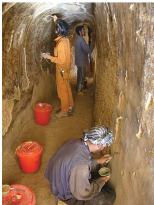
Grouting and edging of the exposed edges of the murals at the pradaksina passage in Cave I

Conservation of the mural paintings: Two pilot projects for the conservation of intact murals at Buddhist Caves I and N(a) were carried out. The whole remedial treatment at Cave I was completed with grouting and edging of the exposed edges of the murals that had been seriously damaged by vandalism and illegal lootings during the period of internal conflicts. A drainage system was installed in a crack of the cave for further protection from water infiltration.