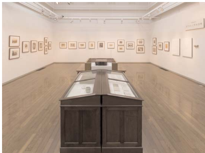
Gallery scene

niques for the formation of digital images that is being executed for the purpose of the conservation and utilization of photographic materials. (Duration of the exhibit: November 15, 2007 to May 17, 2008)