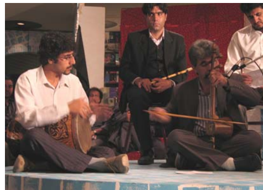
Performance at the City Theatre Café (City Theatre of Tehran BF1) (Aug. 25)

The Seminar was held prior to the 13th Tehran International Ritual-Traditional Theatre Festival (August 23-28). During the festival, various performing arts were presented at many places in Tehran by players from different places, mainly from Iran and neighboring coun-