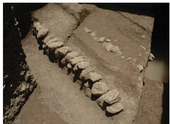
Wall possibly dating to the Buddhist period

Conservation of fragments of the Bamiyan Buddhist manuscripts: Small pieces of birch manuscripts have been carefully flattened and mounted since over 900 pieces were excavated in 2003 and 2005 in a very poor condition from