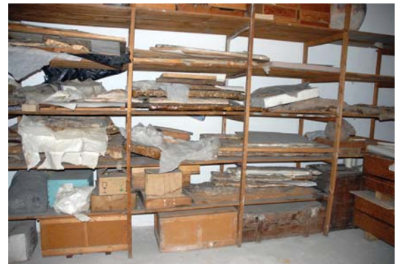
Current conditions of mural pieces which were detached during the USSR period; storage room of the National Museum of Antiquities, Tajikistan

After the meeting, condition survey of mural paintings stored in the Tajikistan National