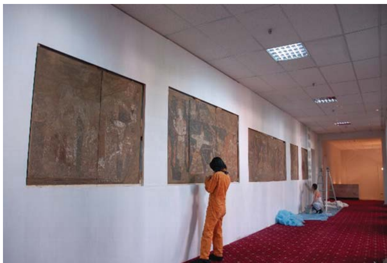
In situ condition survey of detached Sogdian murals from Penjikent at the National Museum of Antiquities, Tajikistan