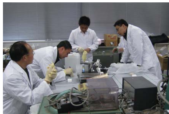
Trainees from Xi'an and Longmen (experimenting with synthetic resin treatment)