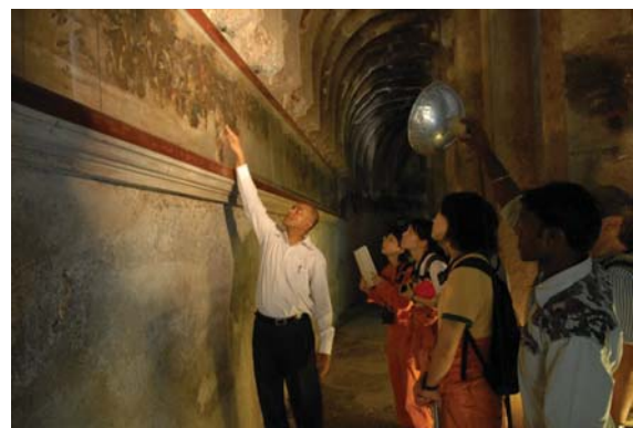
Indian conservation specialist explains the blackened mural paintings due to darkened shellac varnish

cliff as Buddhist monasteries and decorated with exclusive paintings and sculptures. Most of the paintings show yellowish tint colour due to past