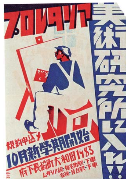
A poster for the Proletarian Art Institute (around 1930)