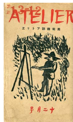
Cover of Atelier , volume 1, number 10

The Department of Research Programming, which is in charge of constructing archives of cultural properties, is preparing for the International Symposium on the Conservation